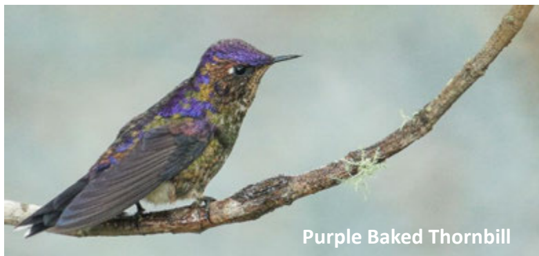
Purple Baked Thornbill